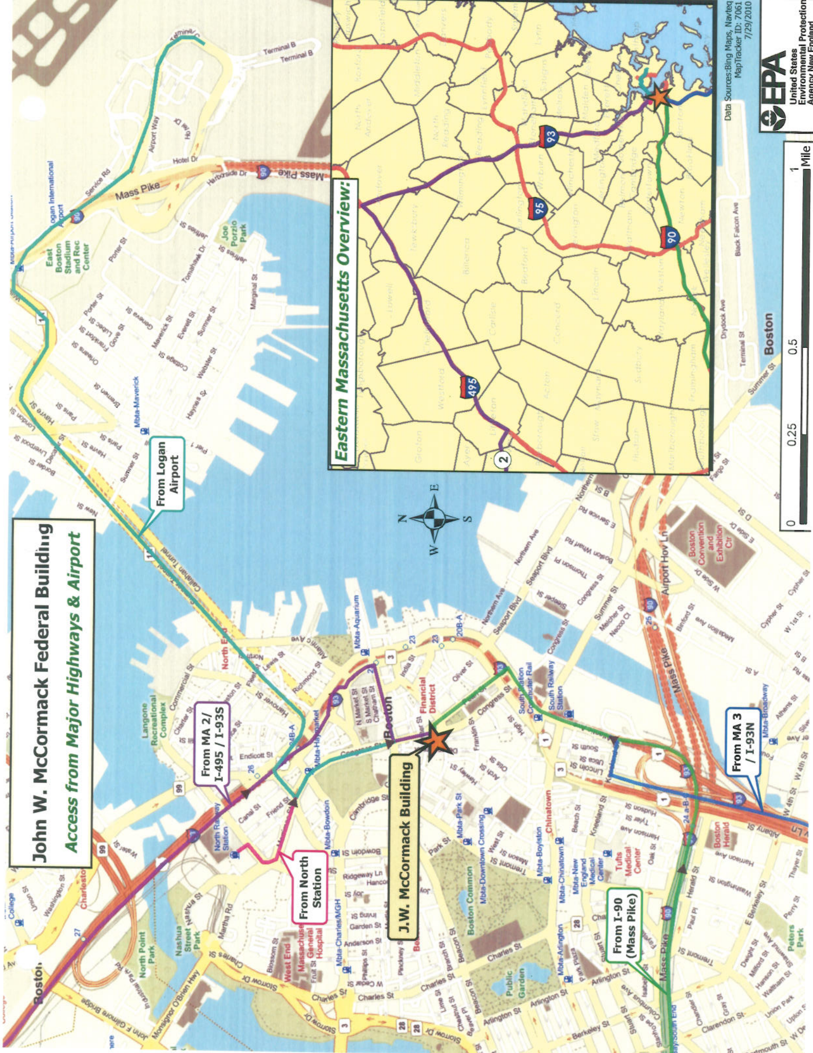
Eastern Massachusetts Overview:

Data Sources: Bing Maps, Navteq MapTracker ID: 7061 7/29/2010